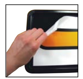
Lay header (B) flat on table. Place header graphic (C) Velcro<sup>™</sup> side down, on Velcro<sup>™</sup> receptive header (B) of the display.