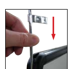
Step 3 Line up the connector (D) with the groove on the edge of the center panel (A). Push down until the connector is sitting on top of the panel (A). Repeat on the other side of the center panel.