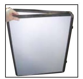
Step 2 Unfold side panels to approximately 30° angles and set on tabletop.