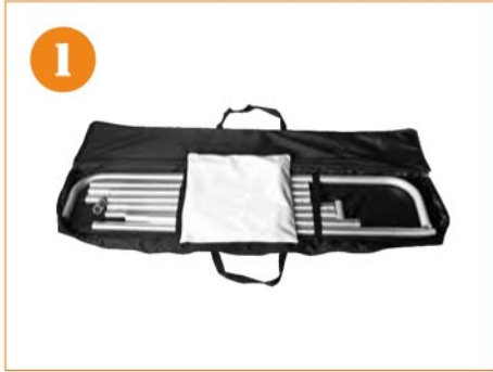
1. Open padded carry bag containing unassembled stand