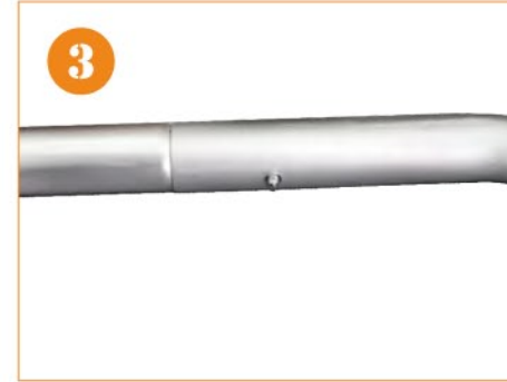
3. Lay out and assemble frame until pieces snap together securely