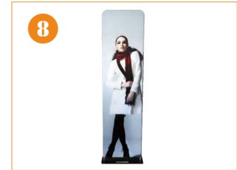
8. Completed unit with graphic shown here