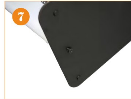
7. Attach base with provided screws