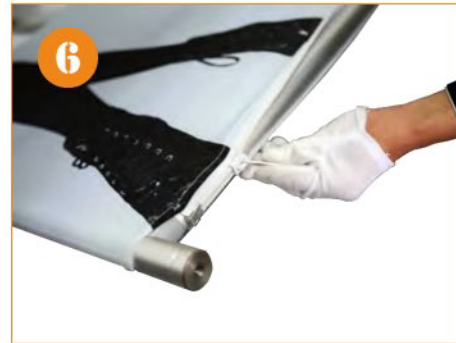
6. Fasten with zipper as shown