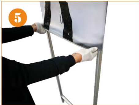
5. Carefully slide graphic over the frame to cover