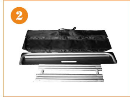
2. Remove frame components from the bag