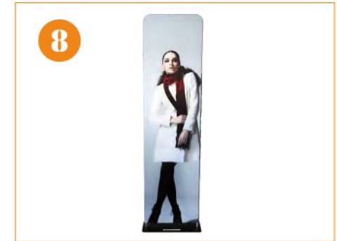
8. Completed unit with graphic shown here