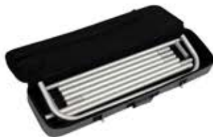
Shown with optional Silver Bag