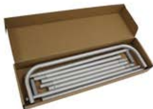
Shown with standard packaging