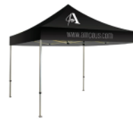
Heat Press Casitas