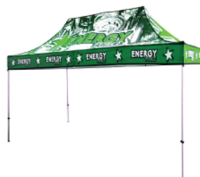
15ft Casita Canopy