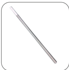
Lower shaft extension