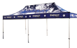
20ft Casita Canopy